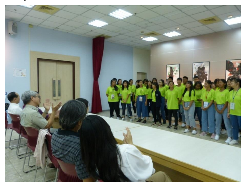
海外學員節目表演 Performance of Compatriot Youth